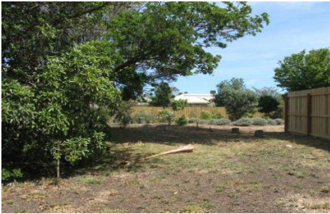
2/65 Aberdeen Street NEWTOWN VIC

A unique opportunity presents itself with this vacant allotment of 382m2. Capitalise on the versatility with the ability to build your dream home or develop the site (subject to council approval). With title available, fully fenced and on the doorstep of the bustling Pakington Street this is sure to be a prudent investment.