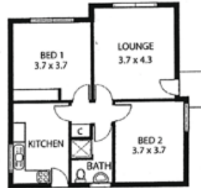
UNIT 4 GROUND FLOOR