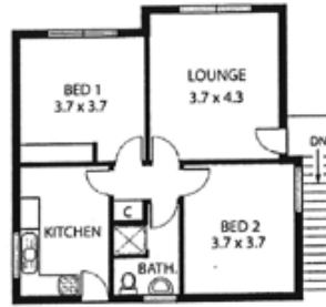
UNIT 5 FIRST FLOOR